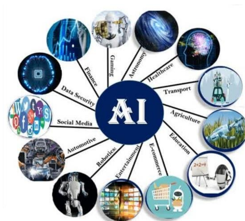
Figure (3) Applications of Artificial Intelligence